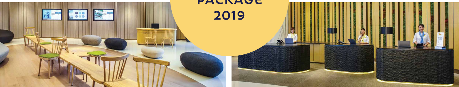
Our new look lobby inspires calm in an urban oasis while upgrading the arrival experience.